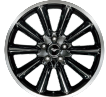
19" x 9" Front/19" x 9.5" Rear Black-Painted Aluminum Standard