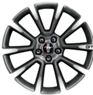
19" Argent-Painted Machined Aluminum Included: California Special Edition