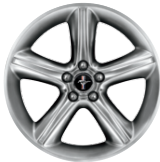
19" Premium Luster Nickel-Painted Aluminum Optional