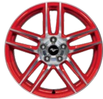
19" x 9" Front/19" x 10" Rear Red-Painted Machined Aluminum Included: Boss 302 with Laguna Seca Package