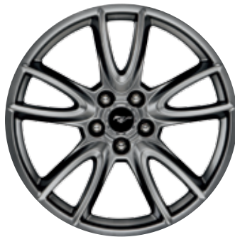
19" Dark Stainless-Painted Aluminum Included: Brembo™ Brake Package