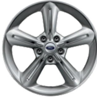
18" Wide-Spoke Painted Aluminum Standard