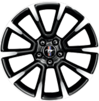
19" Painted Machined Aluminum Included: V6 Premium with Performance Package