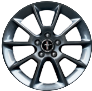
18" Sterling Grey Metallic-Painted Aluminum Included: V6 Premium with Mustang Club of America Special Edition