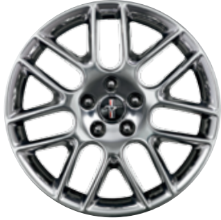
18" Polished Aluminum Included: V6 Premium with Pony Package