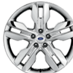
20" Chrome-Clad Aluminum Available on SEL