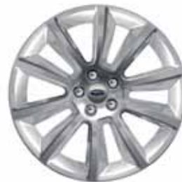
20" Bright-Painted Aluminum Optional