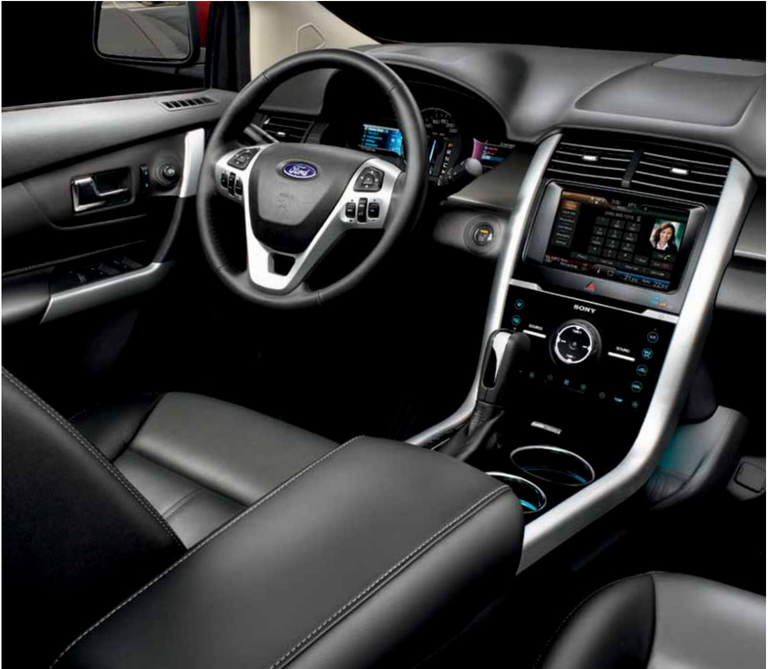
Charcoal Black leather trim with available equipment. | Ambient lighting. | Chrome, oval exhaust tips. | Paddle shifters.