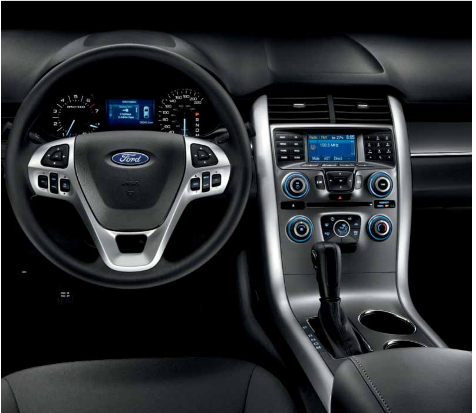
SE. Charcoal Black. | 2.0L EcoBoost® I-4 engine. 1 | Easy Fuel® capless fuel filler. | SEL. Charcoal Black cloth trim. | 12-volt powerpoint, one of 4 in Edge.