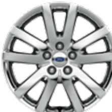
18" Chrome-Clad Aluminum Available on SEL