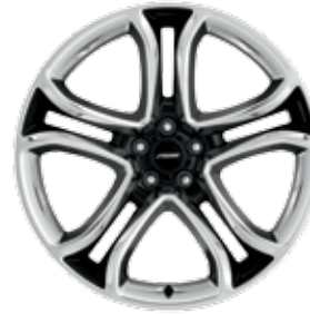
22" Polished Aluminum with Black Spoke Accents Standard