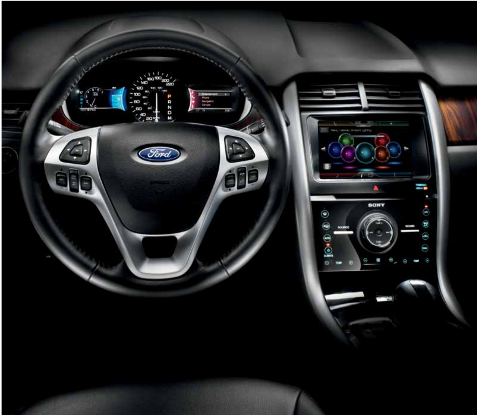
Charcoal Black leather trim. Ford SYNC® with MyFord Touch® and available equipment. | EcoBoost® exterior badging. | Adaptive cruise control and collision warning with brake support! 1 | Dual head restraint DVD by INVISION. 2 | Sienna leather trim.