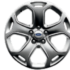
18" Painted Aluminum Standard with EcoBoost I-4 on SE Standard on SEL