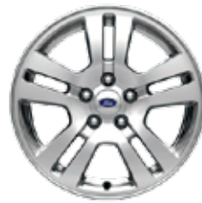
17" Painted Aluminum Standard with 3.5L V6 on SE